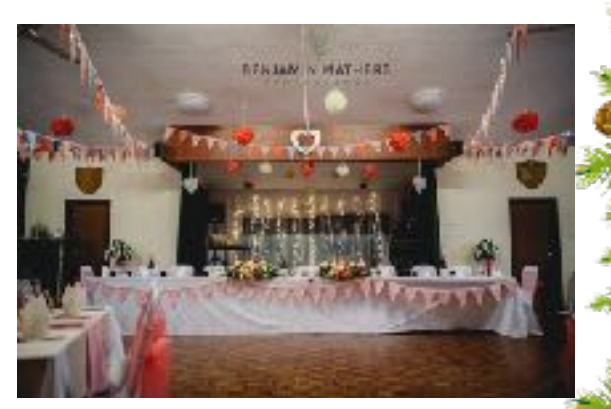
These pictures show a wedding that was recently held at the village hall