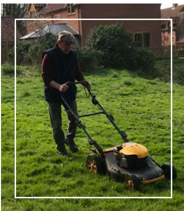
Mowing at The Pit by Duncan Westlake

Fortunately, we only have to do half of the whole area each year, as delineated by the boardwalk; this time it was the turn of the section furthest from Lower Street.